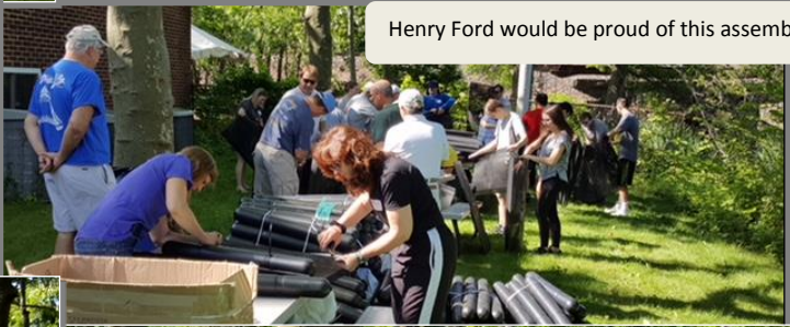
Henry Ford would be proud of this assembly line