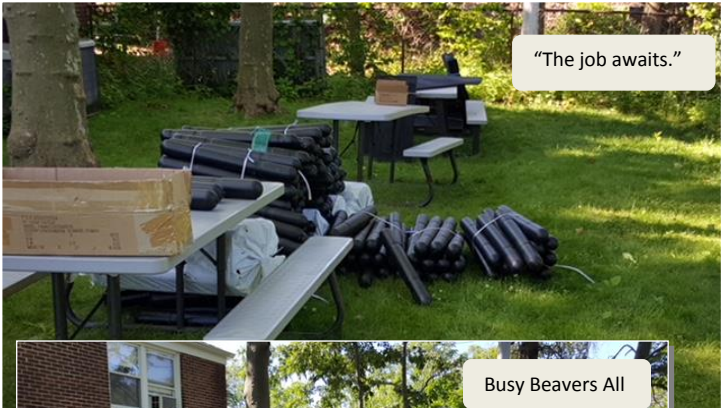
“The job awaits.”