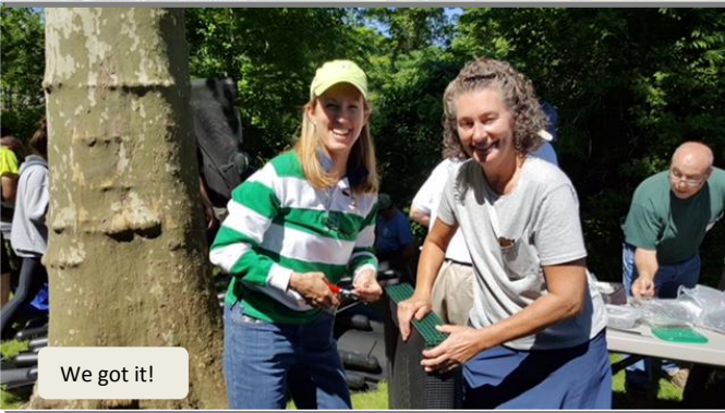
We got it!