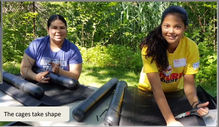
The cages take shape