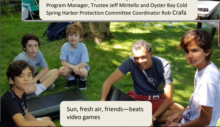
Sun, fresh air, friends—beats video games