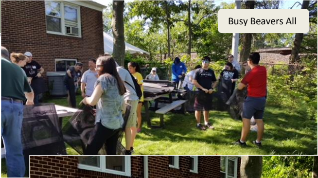
Busy Beavers All