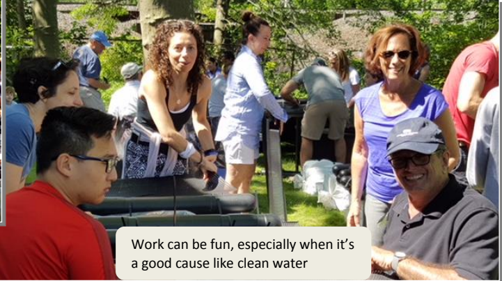
Work can be fun, especially when it's a good cause like clean water